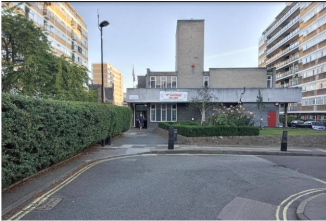
1. Above photo of the building entrance

For slow walkers 10 minutes' walk from Pimlico Tube Station (on the Victoria line) – for those who will be hopefully playing in any future games photo of the turning to take and the long shot of the venue to help guide you there.