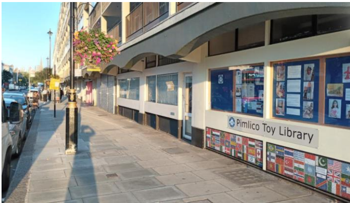
3. Looking back to Pimlico Station (by the church steeple in the distance). Glasgow Terrace on the corner to Pimlico Toy Library. As shown in the photo below.