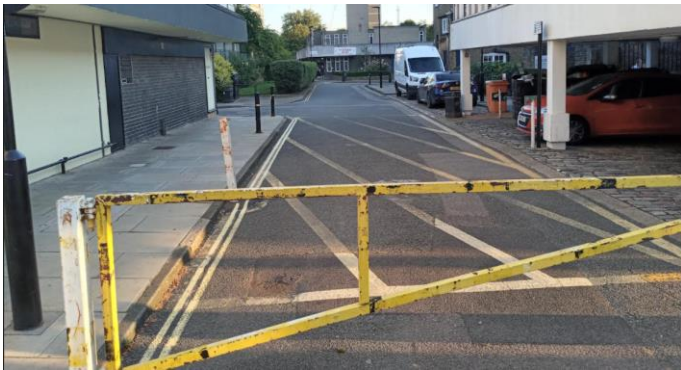
2. Top of the turning (Glasgow Terrace) where you have walked along the main road from Pimlico Station (Lupus Street) showing the venue in the distance.